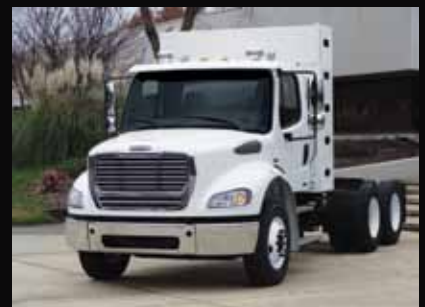
Consider going green with the M2 106 hybrid or the M2 112 natural gas tractor (shown).