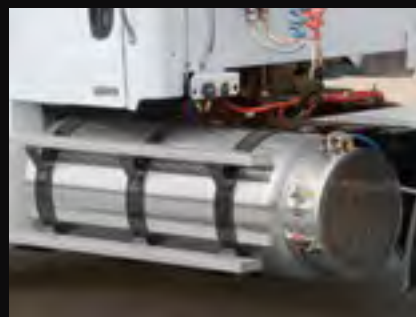
Stainless steel LNG fuel tanks are designed to keep fuel in its liquid state and offer an approximate range of 440 miles depending on your application.