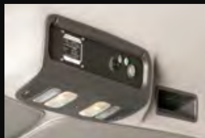
Standard methane gas detection system alerts the driver in the event of a fuel leak.