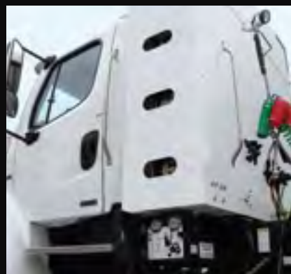
Housed in an enclosure behind the cab, carbon fiber reinforced aluminum type 3 compressed natural gas (CNG) fuel tanks offer an approximate range of 400 miles depending on your application.