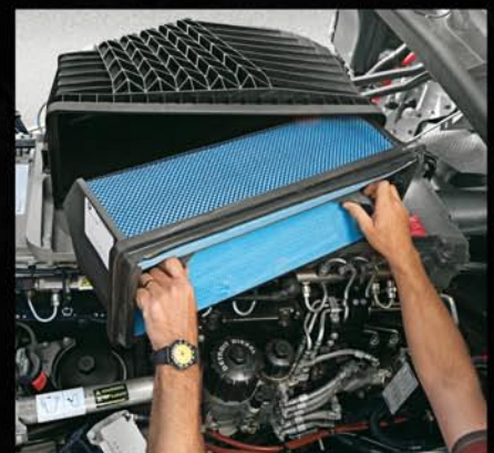
Donaldson Advanced Power Core Air Filter