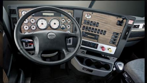
Standard Bandon Driftwood Dash