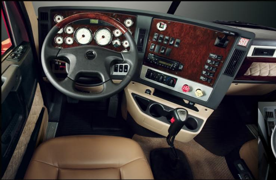
Optional Signature Oregon Burl Wood Dash