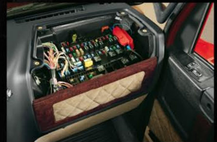
Power Distribution Module (PDM)